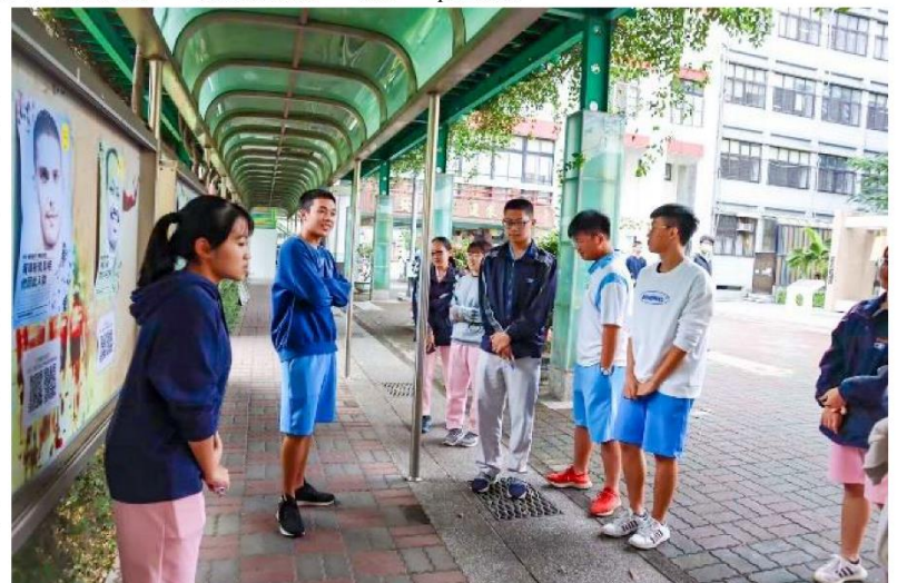
Write For Right movement was held in HWSH in December 2020.

We all will not expect the effect we did something, only when we carry it out, so just do it! Just making an effort to uphold human rights: Writing for rights, donating money, or participating in a movement—just do the right things. In this way, we all could make a difference to this world!