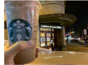
Bo-shen Huang, Xiang-hong Zhang

Starbucks in Huwei located in Yunlin Huwei, the Starbucks in Huwei is a cafe that its building is full of history. The building used to be the police station and fire station during the Japanese occupation. However, the coffee shop still retains the buildings left over from Japan occupied time, such as the sliding pole of the fire station, the logo of the police station. Additionally, the exterior of the building is full of Japanese flavor. The marks on the walls represent the years he has experienced. People are attracted to its appearance before entering into the buildings.