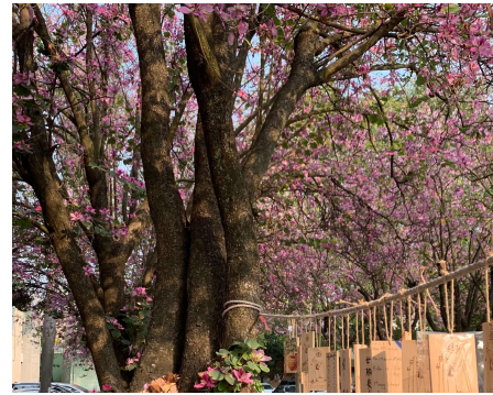
3 years ago